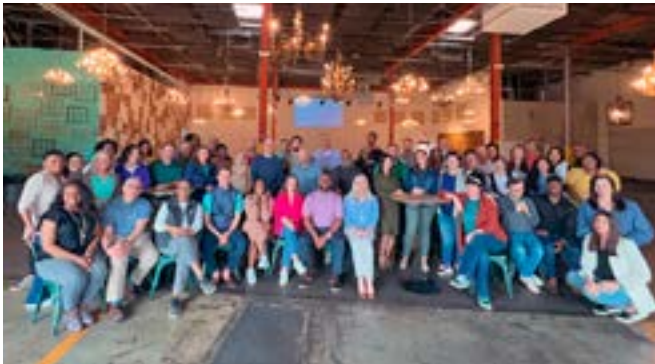
FROM TOP: Redwood Materials is another one of several dozen massive investments being made in the South to support the EV industry.

Thermo Fisher expanded in the Richmond, Va., MSA last year.